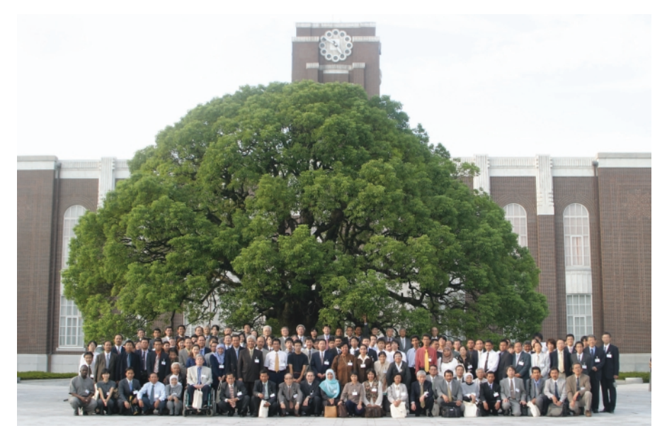
All the symposium participants

provide a forum for scientists from Japan and Southeast Asian countries to share up-to-date information pertaining to a wide variety of research subjects in wood science and technology in relation to the establishment of a sustainable society, and papers related to the following topics were invited: wood formation, biotechnology, wood chemistry and pulping, bark utilization, wood-based materials, biodegradation and preservation of woods, biomass utilization and biomass energy, and envi-