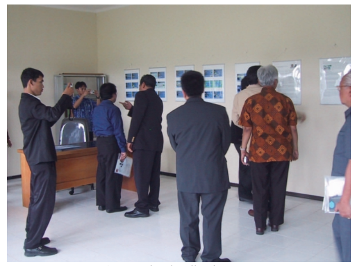
A scene after the official opening