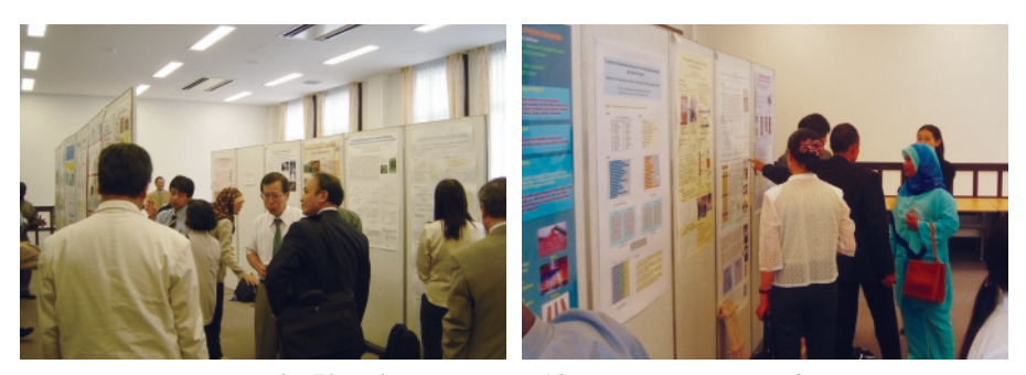
Besides 70 oral presentations, 46 posters were presented