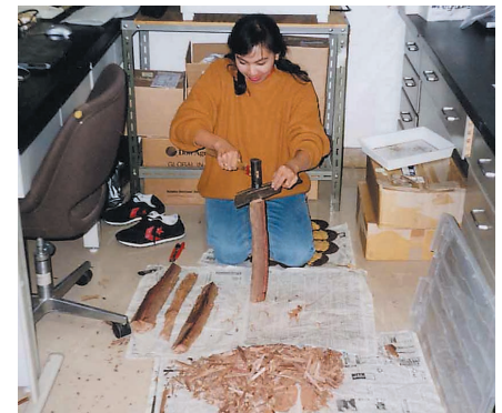
Cutting a wood block to find Cryptotermes domesticus Haviland

Another interesting experience was that, I had a chance to take a Japanese language course. This was important