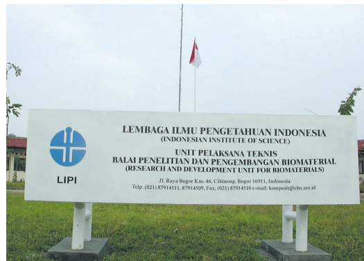
Signboard of the new institute