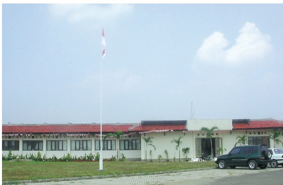
Building of R & D Unit for Biomaterials, Cibinong

The facilities of the institute includes office and laboratory buildings totaling about 1,700m 2 , land area of 20,000m 2 , testing equipment, processing equipment, workshop, field testing facilities for termites and weathering,