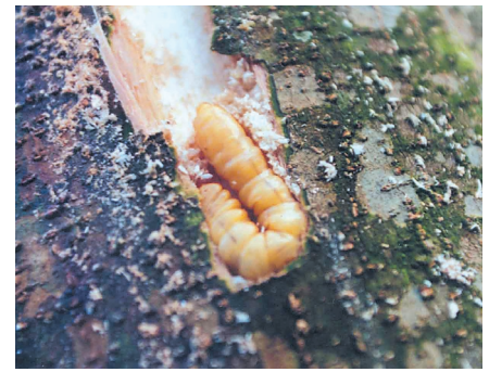
Xystrocera festiva Pascoe (stem borer) attacking 'sengon' tree

The research started from April 2003. Results obtained up to June 2003: seeds of both mangium and sengon, collected from plus trees, were germinated in vitro for preparing shoot multiplication. To solve the browning problem of nyatoh, several composition of media have been tried. Shoot tips obtained from shoot multiplication of in vitro mangium and sengon have been available as materials for preliminary genetic transformation work. Plasmid of pBE2113/CtCc1AcDNA and pBE2