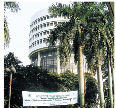
LIPI head quarter in Jakarta