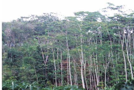
Paraserianthes falcataria (L.) Nielson ('sengon') tree

research: Acacia mangium Willd, Paraserianthes falcataria (L.) Nielson and Palaquium hexandrum Burk, all of them are indigenous plants of Indonesia native to Moluccas and known as commercial timbers. The selection of these species was also related to the forestry program in Indonesia. Since PELITA IV (Fourth Five-Year Development Plan: 1983-1988), one of the program of the Indonesian Government in the forestry sector has been Industrial Forest Estates (HTI). Twenty-eight species have been recommended for use in this program, including the three species in this program, of which Acacia mangium Willd and Paraserianthes falcataria (L.) Nielson have the highest priority for development. One of the objectives of the program is to fulfill the timber needs for wood industries in Indonesia and abroad. Acacia mangium , locally known as mangium, and Paraserianthes falcataria (L.), locally known as sengon, are both belong to Fabaceae family of fast growing and multipurpose trees species