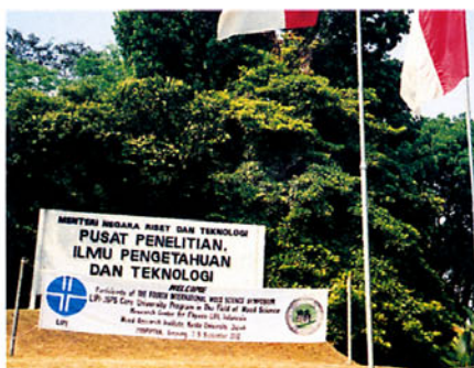
Welcome sign board of the symposium

Following the opening ceremony, there was a press conference at the VIP room. The press conference was attended by Dr.