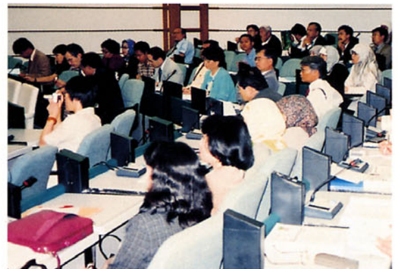
Discussion and talk in the symposium

I am sure that everybody left this symposium with the feeling that it was scientifically and personally very rewarding. I hope that we will be able to meet you all again in beautiful Kyoto in 2004!