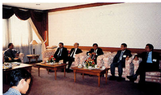
Interview by press

It should be noted that many scientists and students who were not registered as the member of the Cooperative Project supported by JSPS attended the symposium. Furthermore, the numbers of presentations increased by 40% compared with the 3rd symposium. The high interest in production and sustainable utilization of wood by the related scientists together with the global society encourage us to proceed with our lines of the JSPS-