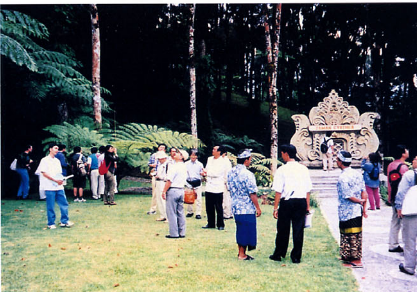
Excursion in Bali