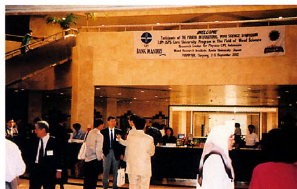
Registration at entrance of conference building