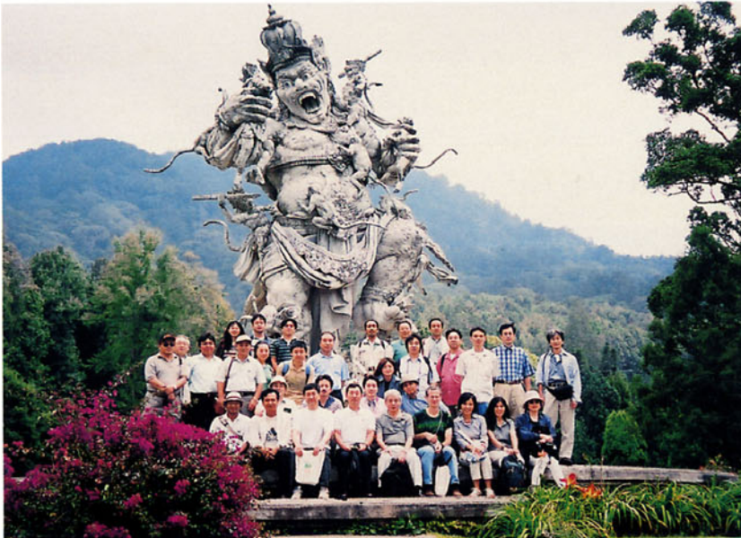
Participants in Bali excursion.

Early on the morning of September 4, 2002, we left the guesthouse of LIPI to the Jakarta airport by bus, then flew to Denpasar airport in Bali by airplane, arriving before noon. The coordinator of the Bali excursion gave us a warm welcome there, and we checked in to the Bali Beach Hotel and had lunch at the Warung be Pasih restaurant. Our excursion started in the afternoon by bus.