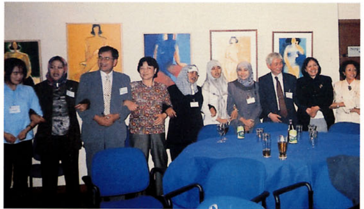
Friendship linkage in the banquet

The next symposium will probably be held in Kyoto. I hope to see old friends and colleagues again as well as newcomers. And I sincerely hope this program will develop to the next advanced stage.