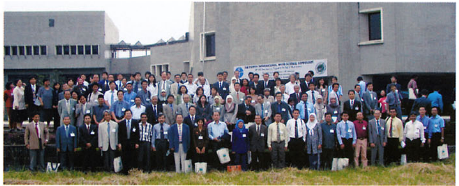
All the participants of the symposium

Again, I really appreciate the effort of the Indonesian organizing committee, and rally hope that the JSPS-LIPI Core University Project will contribute the establishment of sustainable global society based on the most important renewable resource, wood or lignocellulosics. Also, I really hope that more new data in the field will be presented in the next symposium to be held in 2004 in Kyoto.