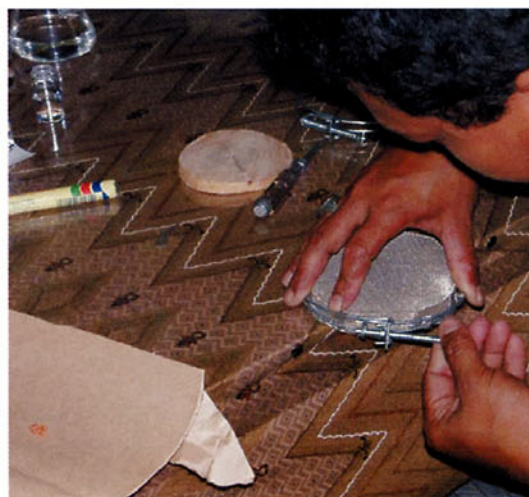
Preparation of wood disc samples for alkali cooking

Below photo displays the preparation of wood-disc samples for the alkali cooking. The wood discs were fitted with a metal rim to avoid defibration during cooking. Left photo shows a small laboratory autoclave used for the alkali cooking.