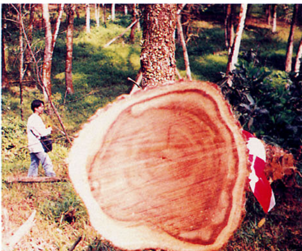
Felled Acacia mangium at UPM's plantation

On the machining properties, the boards that contained tension wood incurred burning marks, torn grain and fuzzy grain on the surface after sawing, planing, boring and sanding. Regarding mechanical properties, the tension wood was stronger and stiffer than normal wood. However, the tension wood was hard to coat and laminate. Regardless of species or type of wood, the time taken to dry the boards to about 11-18% MC using the low temperature dehumidifier kiln was 21 days. Casehardening was found on the boards containing tension wood. Boards with tension and normal wood of A. mangium were found to have similar cupping, bowing and slight to moderate end-checks and honeycombing, but the tension wood had a relatively higher degree of the defects. Tension wood of A. auriculiformis had more severe defects than normal wood. The two species had more or less the same defects except that the normal wood of A. auriculiformis was free from twisting. End-checks and honeycombing were found to be more severe