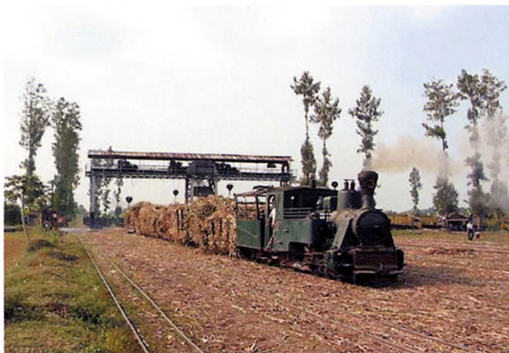
Production of bagasse from sugarcane industry

Continued use of fossil fuels has caused serious environmental problems such as production of undegradable toxic compounds and emission of carbon dioxide. Therefore, it is necessary to emphasize that utilization of biomass as chemical and energy resources in harmony with environmental safeguards is urgently