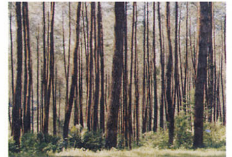
Production forest in Indonesia

Yamamoto (Nagoya Univ.) for the characterization of growth between the wild-type and transgenic tropical plants. T. Furuno and S. Katoh (Shimane Univ.) expect to analyze the genes involved in the formation of monoterpenes and T. Umezawa (Kyoto Univ.) will study the formation of wood on tropical trees. We hope future forestry efforts are greatly improved by such trees, beginning a new era of wood production and quality.