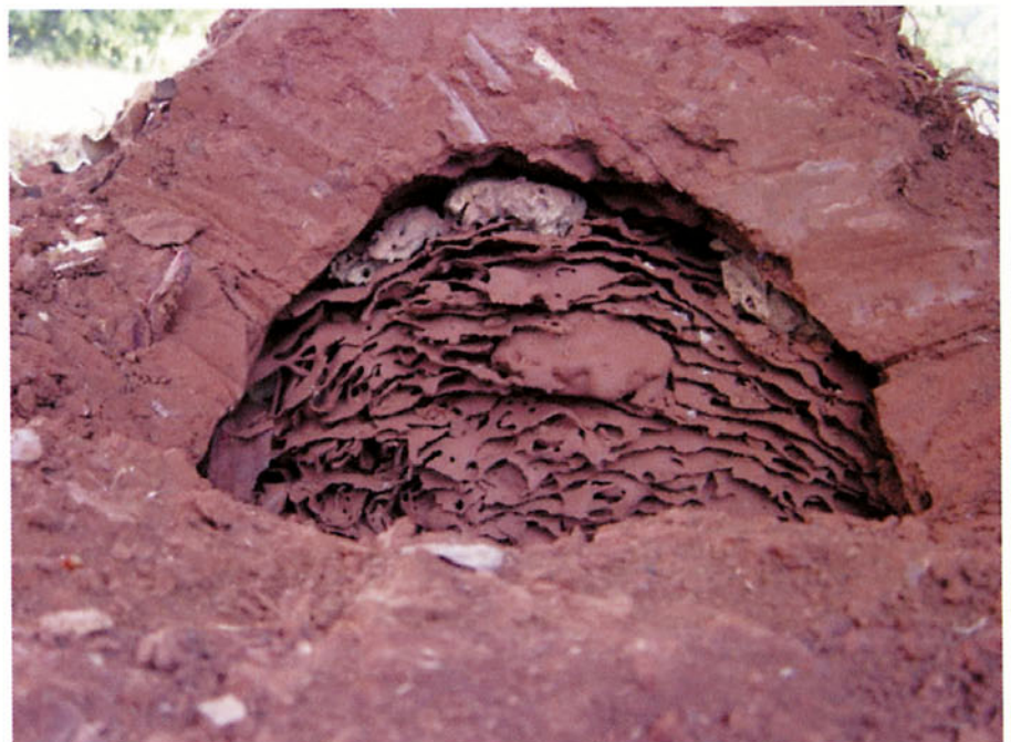
Termite mound net of M. gilvus

many kinds of tropical wood species in Indonesia and their resistance to Indonesian termites was evaluated, as many Japanese and imported woods were examined for Japanese termites in Japan, showing the importance of using appropriate wood species for wood products to prevent termite attack. Furthermore, damage by dry-wood termites has been extending in Japan, and it is also a serious problem in Indonesia, because it is difficult to detect dry-wood termites and