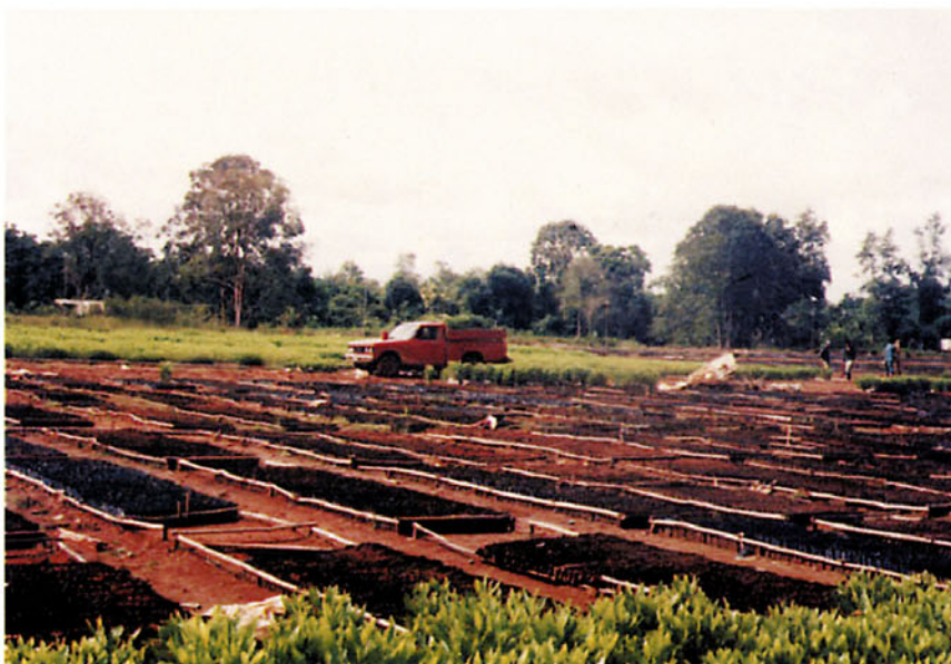
Transportation of the seedlings by truck to the field for planting