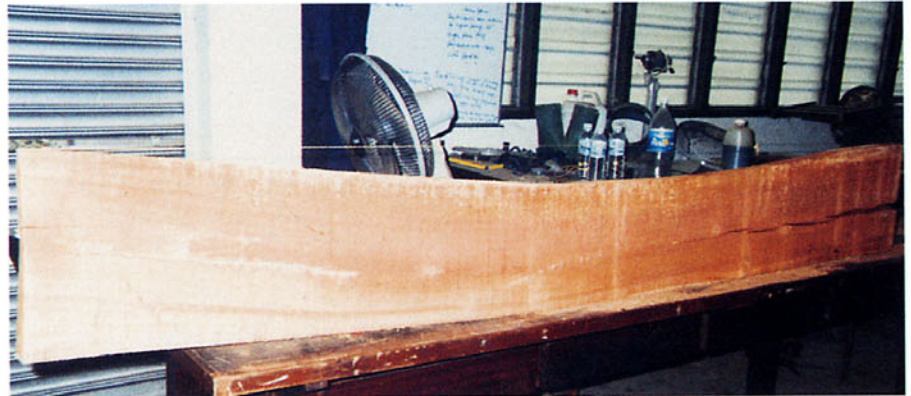
Lumber cut from leaning stem of Acacia mangium

Thailand and other producing countries. In addition, it is crucial to carry out fundamental studies of the analysis and quantification of the morphological properties of tension wood and how they influence the processing and drying properties of the lumbers. An international collaborative research work on these studies will be proposed to the JSPS Core University Program in the next fiscal year.