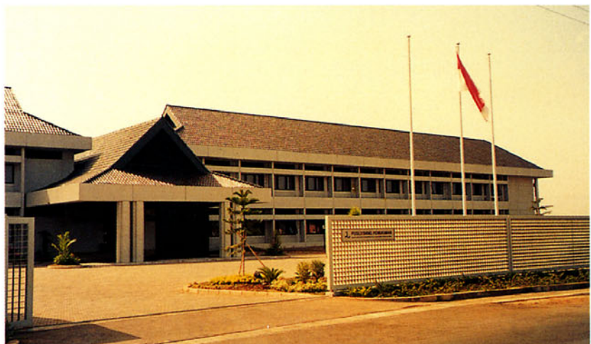
Main Office of the Research Institute for Human Settlements (RIHS)

For supporting the development of wood and wood based materials in the housing and building constructions, research activities based on the existing condition of raw materials have been conducted. Timbers from natural forest in domestic market which are affordable for most peoples are classified as Meranti Campuran (mixed Meranti/Lauan) and mixed hardwood so called Borneo group. Other potential timber resource for building materials is Hutan Tanaman Industri (Timber Estate Crops) with fast growing species stocks. Most peoples have an impression that timber of fast growing species are low strength and non-durable. Because the strength of timber is affected not only by its density but also its imperfection condition, the strength of a piece of wood from fast growing species could be stronger than from mixed tropical species.