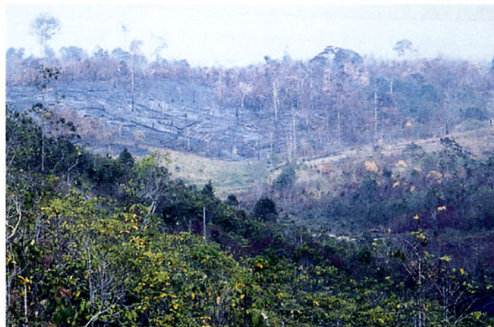
Areas of forest burnt for shifting cultivation (near Bukit Soeharto)