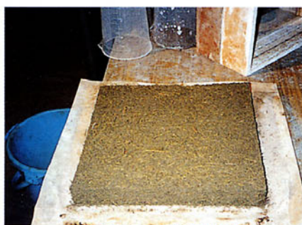
Bamboo-cement mat before pressing