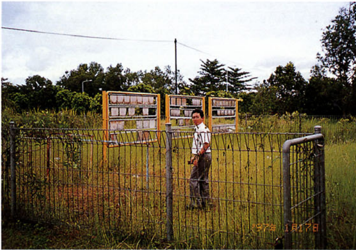
Dr. Sulaeman Yusuf conducting weathering test at Serpong

wood species, albizia, rubberwood and radiata pine, were used. These boards are now exposed to natural weathering at the R & D Centre for Applied Physics, Serpong, Indonesia (Photo).