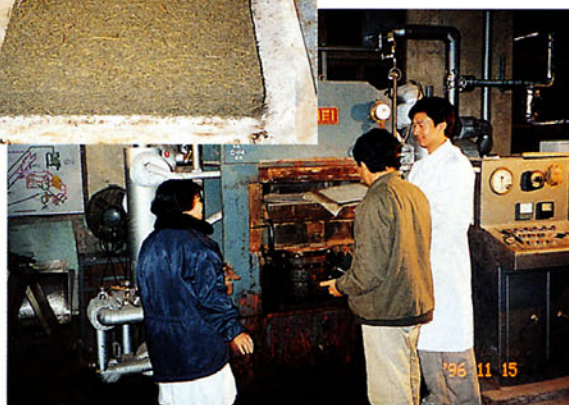
The rapid curing method of steam-injection pressing