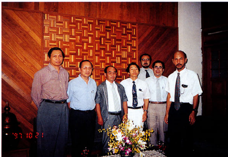
Faculty of Agriculture, Gadjah Mada University