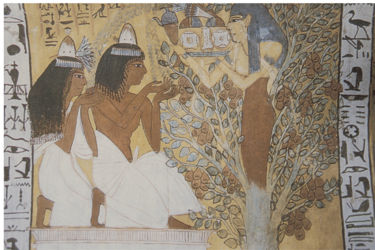
Wall painting of the tomb of Pashedou (TT3 at Deir el-Medineh), New Empire.

Wood in the history of techniques in France and in Europe : restitution of some know-how