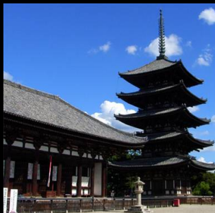
Kofuku-ji temple precincts