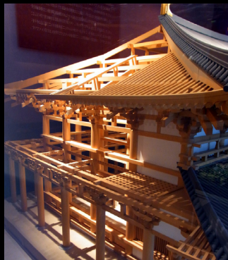
Chukondo (under construction at Kofuku-ji temple)

download from http://www.kyoto-station-building.co.jp/map_en/index.html