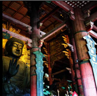
Great Buddha hall of Todai-ji temple