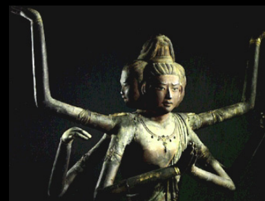
Statue of Ashura (Buddhism guardian) in Kofuku-ji history museum.