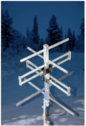
Prototype antenna from the EISCAT_3D Design Study.

EISCAT_3D is designed for continuous operation, capable of imaging an extended spatial area over northern Scandinavia with multiple beams, interferometric capabilities for small-scale imaging and with real-time access to the extensive data. The highly modular and expandable design includes a central active site with a diameter of few hundred metres, comprising tens of thousands of antennas including smaller outlying arrays for imaging applications. Four smaller receiver sites will be located 50 to 200 km from the central site.