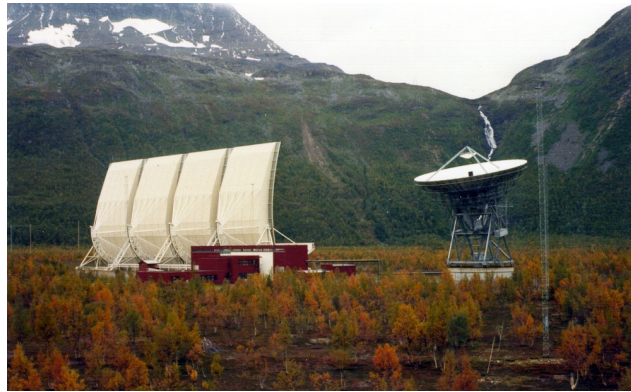
EISCAT VHF and UHF radars at Tromsø

EISCAT_3D is designed for continuous operation, capable of imaging an extended spatial area over northern Scandinavia with multiple beams, interferometric capabilities for small-scale imaging and with real-time access to the extensive data. The highly modular and expandable design includes a central active site with a diameter of few hundred metres, comprising tens of thousands of antennas including smaller outlying