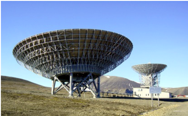
The EISCAT Svalbard Radar.

EISCAT operates three high-power incoherent scatter radars: the VHF radar with a transmitter and receiver in Tromsø (Norway) and additional receivers in Kiruna (Sweden) and Sodankylä (Finland); the UHF radar in Tromsø, and the EISCAT Svalbard Radar (ESR) near Longyearbyen. The earlier UHF receivers in Kiruna and Sodankylä have recently been converted to VHF after they started suffering interference from mobile phone services.