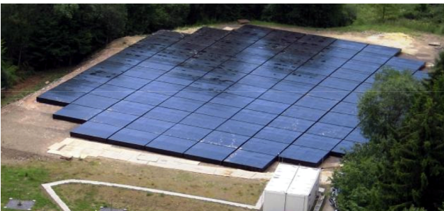
LOFAR station: possible receiver design for EISCAT_3D.

EISCAT_3D is designed for continuous operation, capable of imaging an extended spatial area over northern Scandinavia with multiple beams, interferometric capabilities for small-scale imaging and with real-time access to the extensive data. The highly modular and expandable design includes a central active site with a diameter of few hundred metres, comprising tens of thousands of antennas including smaller outlying arrays for imaging applications. Four smaller receiver sites will be located 50 to 200 km from the central site.