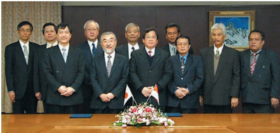
Attendees of the signing ceremony

Thank you very much and terima kasih banyak.