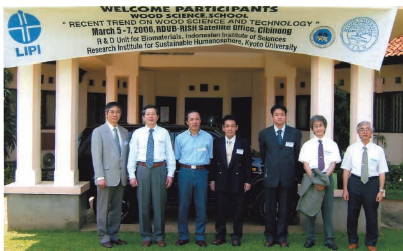
Lecturers of Spring School in front of the entrance decoration

was held in RDUB, LIPI, Cibinong, Indonesia from March 5 to 7, 2006. It was organized by RDUB, LIPI and RISH, Kyoto University with the theme "Recent Trends in Wood Science and Technology". The purpose of the WSS was to share me knowledge and experiences of Japanese professors on the current issues of the topics. It was a chance for young scientists, young lecturers and students to meet Japanese professors as well as to broaden their knowledge and discuss their views.