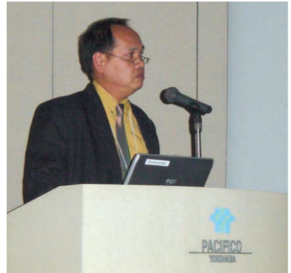
Researcher presenting paper in the conference

Finally, I would like to express my sincere thanks to the organizing committee for the opportunity to attend and present a paper to the symposium. It provided additional knowledge on wood science and technology particularly in my field of specialization on