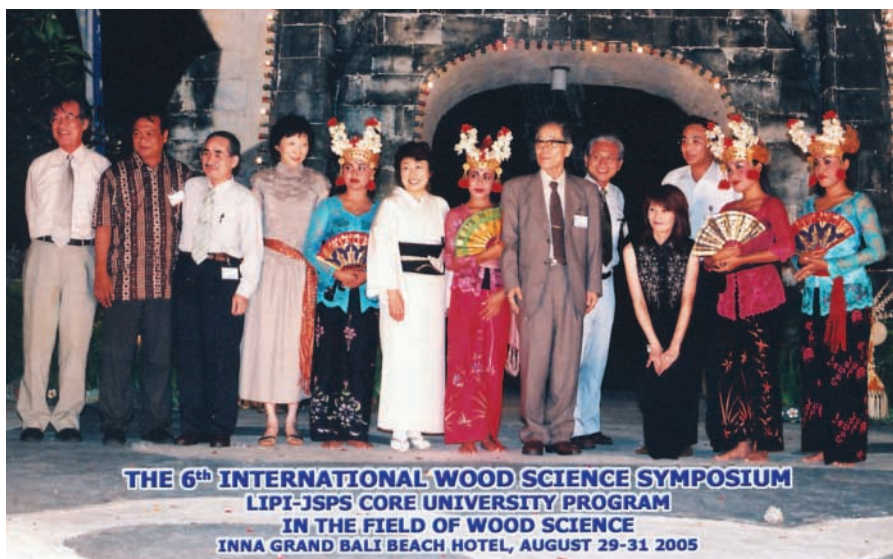
The 6 th International Wood Science Symposium held at Inna Grand Bali Beach Hotel, August 29-31 2005