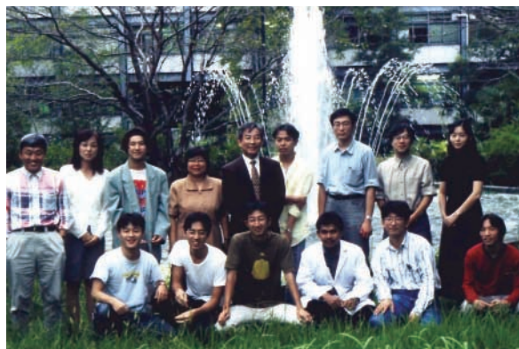
From my old album: I think I was most happy to be surrounded by my collaborators domestic and foreign, and Japanese and Indonesian students. 1998