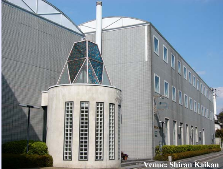
Venue: Shiran Kaikan

http://www.shirankai.or.jp/facilities/access/index_e.html